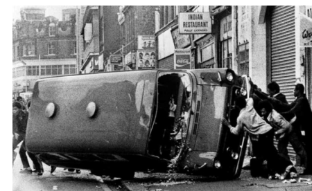
Scenes from the Brixton Riots