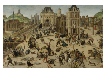
The St Bartholomew's Day massacre

Protestants - a member or follower of any of the Western Christian Churches