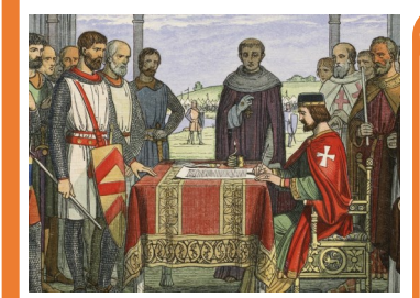
The signing of the Magna Carta