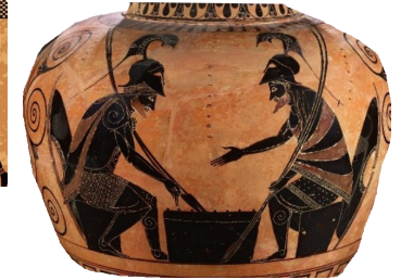
Examples of Greek pottery