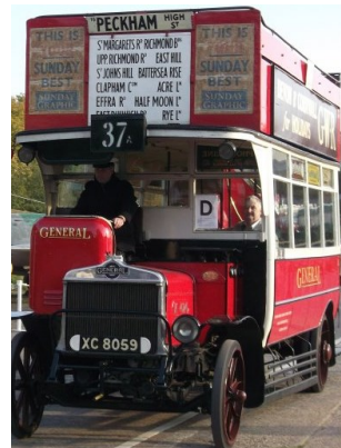
An example of an early Peckham bus.

Geographical Concepts: boundaries, change, climate, interdependence,