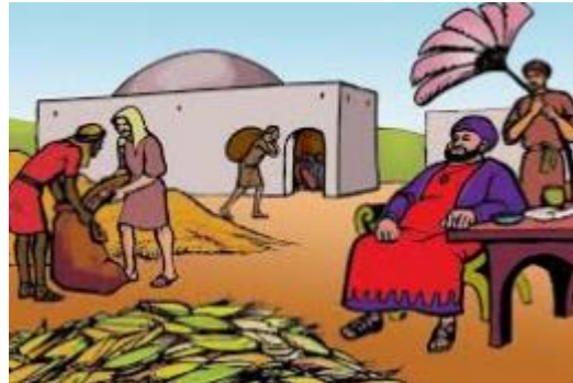
The Parable of the Rich Fool