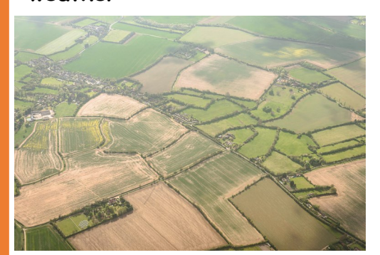
An aerial view of the farm land surrounding London

Retrieval Unit Vocabulary continent, globe, human feature, location, physical feature, precipitation, season, vegetation, weather