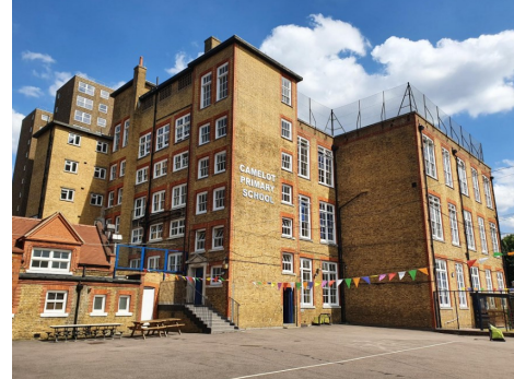
Food is transported all over the world by boats and lorries. Dover, Kent, is a major UK