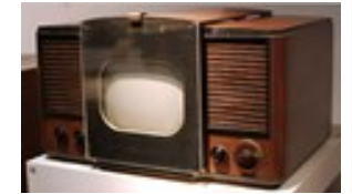
The first mass produced television