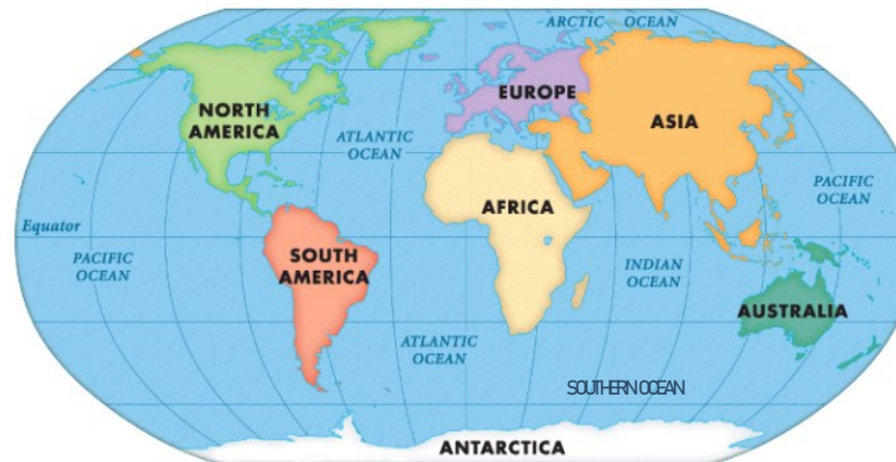
A map of the world showing the seven continents and five oceans.