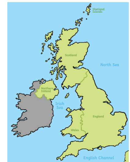
A map showing the seas surrounding the UK.