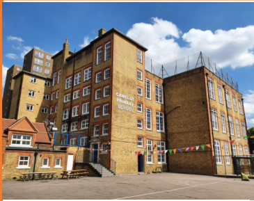
Bird in Bush Primary School is an example of a human feature