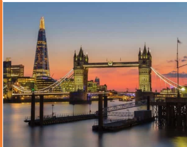
The River Thames is an example of a physical feature