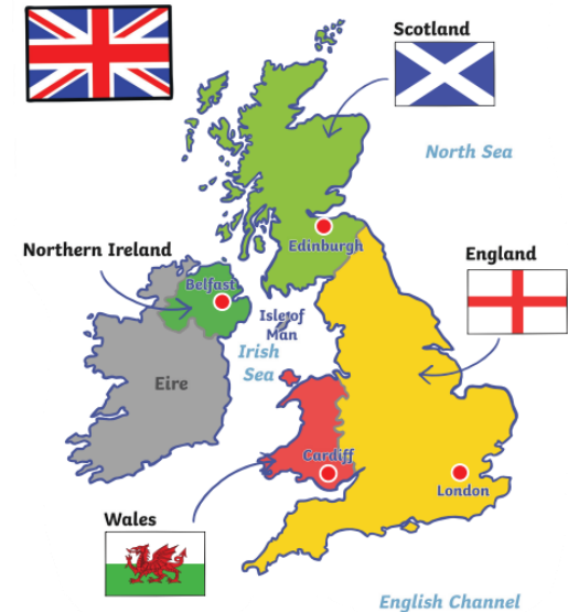
A map showing the location of the United Kingdom within the continent of Europe

The United Kingdom is made up of Northern Ireland, England, Scotland and Wales.