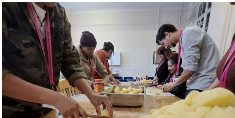
Parent session at Bird in Bush Primary

We finished the session by cooking a spicy potato dish native to Spain - patatas bravas - proving once again that food brings people together. The session provided a brilliant opportunity for the parents to engage with the school community, contribute to our Healthy Zones work, and connect with each other.