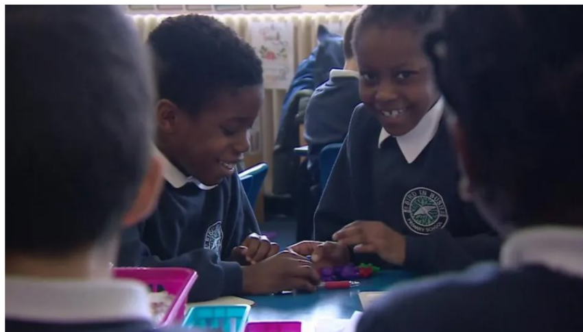
There are likely to be many more school closures and mergers across the capital